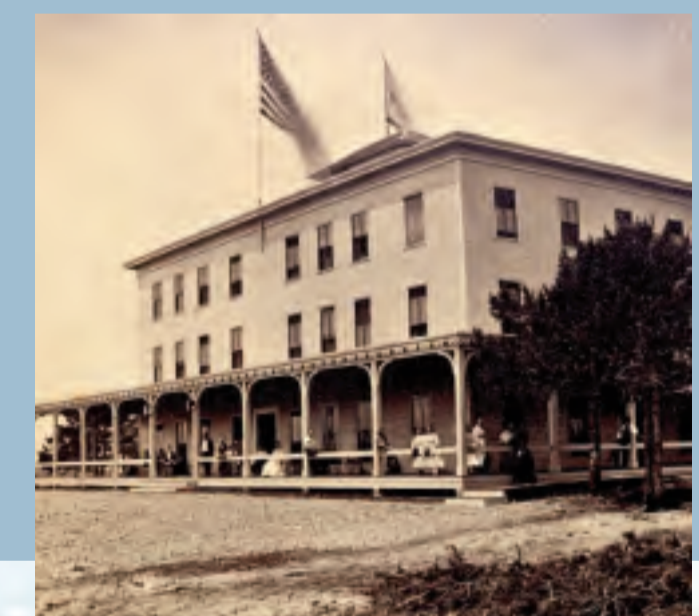
Early View of the Wentworth Hotel, 1870s-80s, Stereograph.