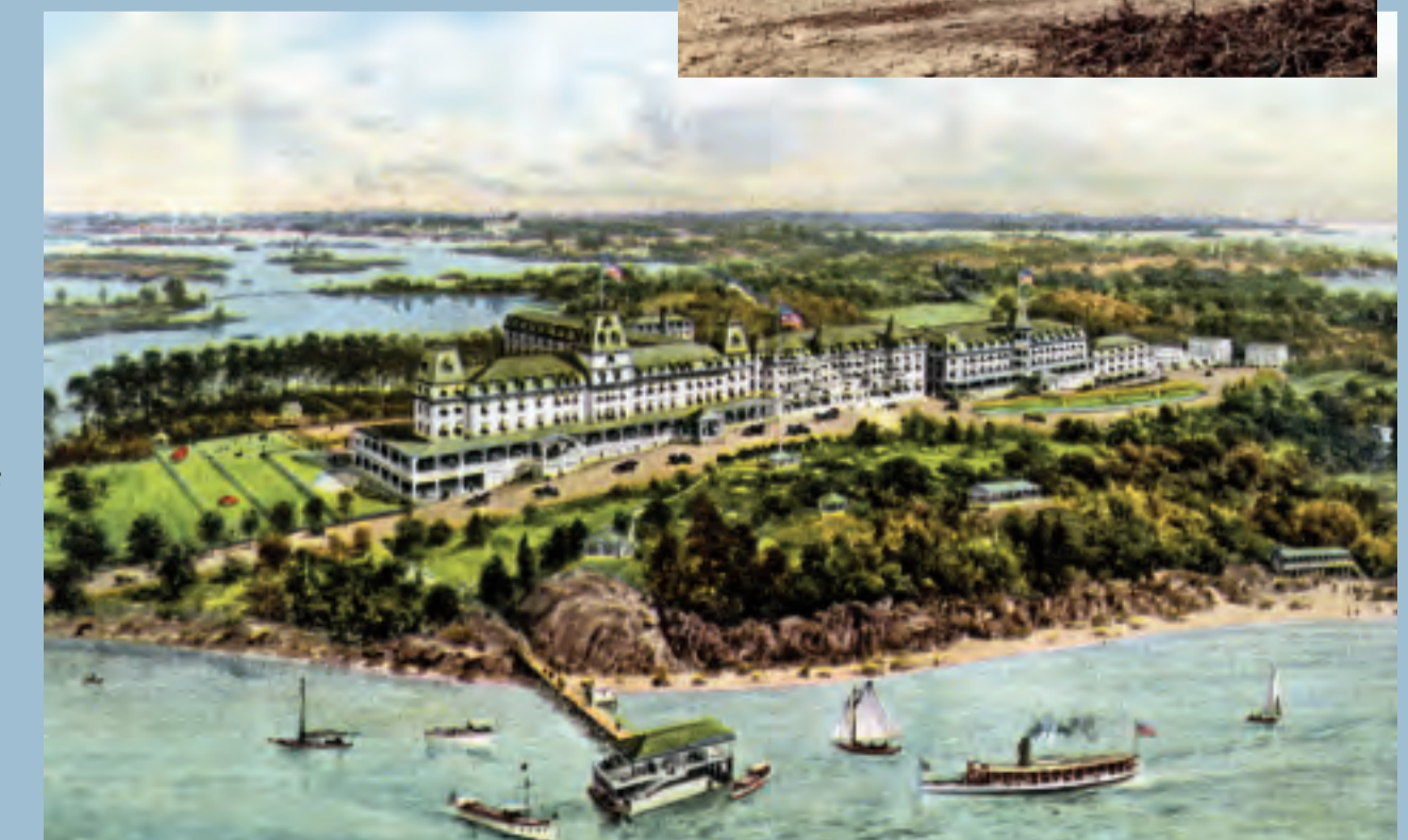
Postcard, Aerial view of the Wentworth Hotel .

Funding for this historic marker was provided by the City of Portsmouth, 2012.